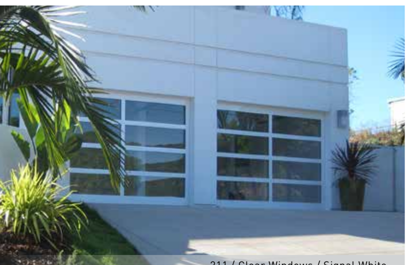
211 / Clear Windows / Signal White