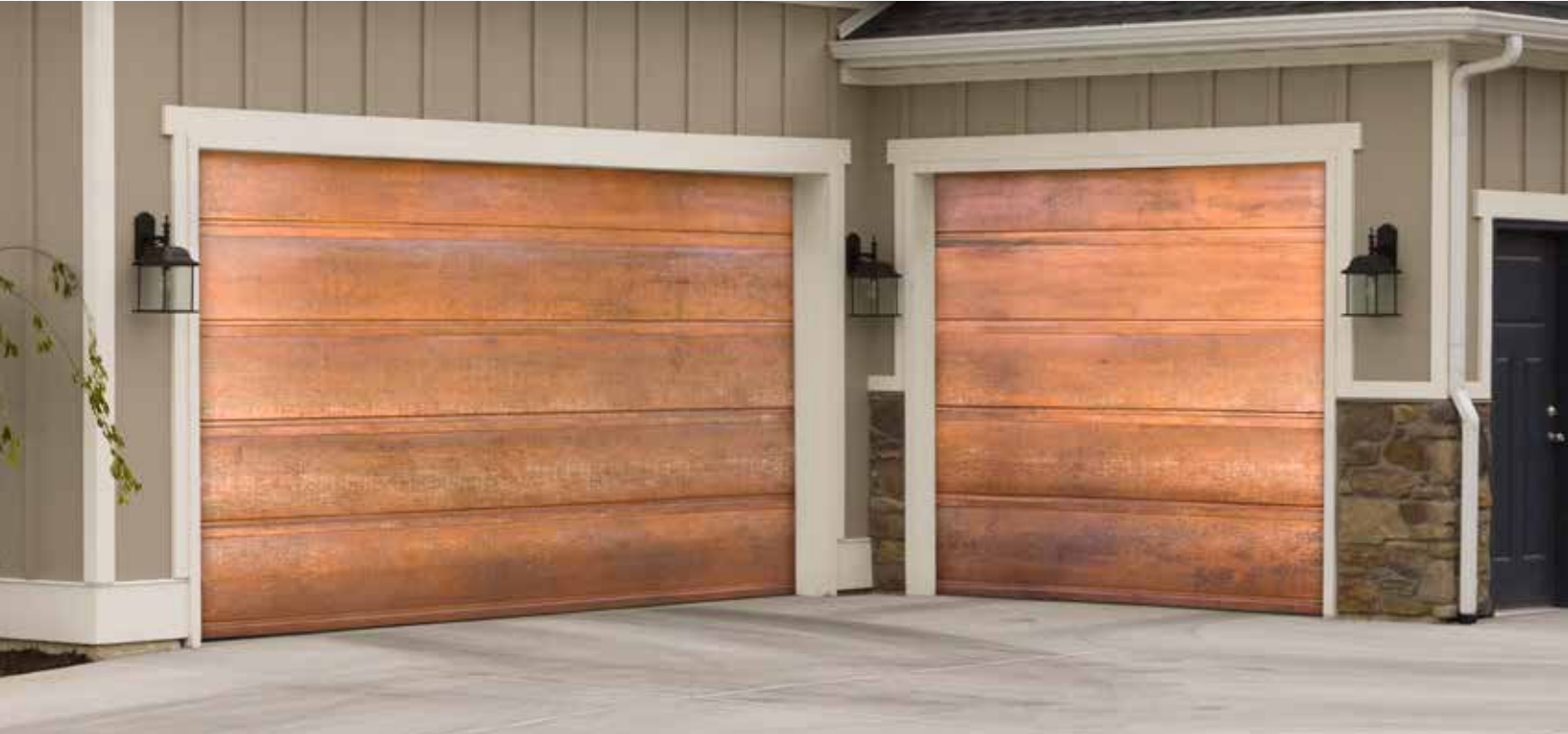
Flush Panel (With Rib) / Copper