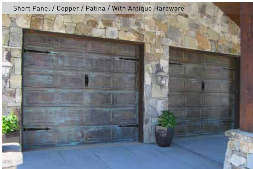
Short Panel / Copper / Patina / With Antique Hardware