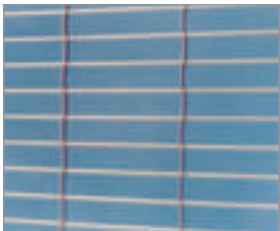
G-6 Pattern 9" (standard) Modified G-6 Pattern 6" available

Model 600 offers numerous grille patterns to choose from. The curtain construction is available in aluminum, galvanized steel, and stainless steel. Finishes include clear or bronze anodized aluminum, galvanized steel, stainless steel #4, and powder coat finishes (Approximately 200 RAL colors or custom colored to match architect specification).