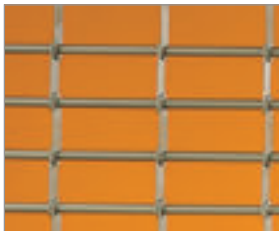
G-8 Pattern 4" (optional)