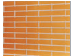
G-1 Pattern 4" (optional) G-1 Pattern modified 3.125"

For technical information, specifications, drawings, visit wayne-dalton.com . Not all patterns available in all sizes. Consult factory for more information.