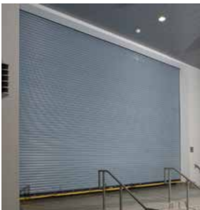
No. 4 slat

Secur-Vent® — Perforated slat provides optimal security and ventilation. Slat consists of \frac{1}{16} " diameter holes offering 17% open area over length of each slat. Available in No. 14 flat slat up to 22' wide x 20' high (available in 20-gauge steel only).