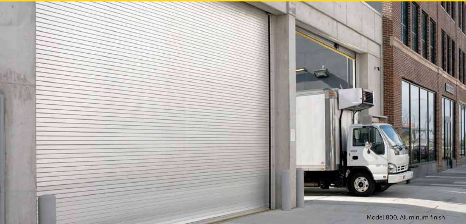
Model 800, Aluminum finish