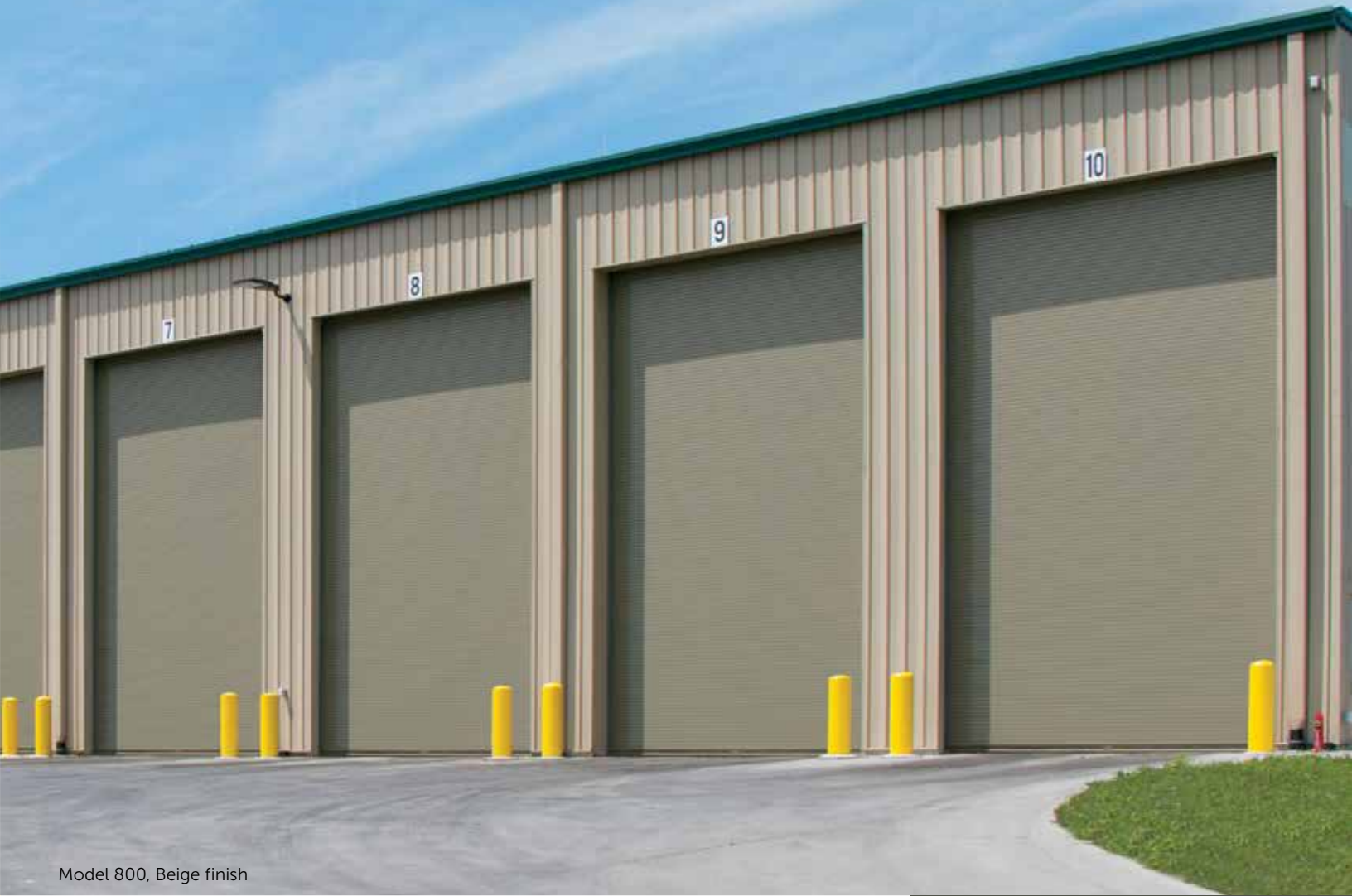
Model 800, Beige finish