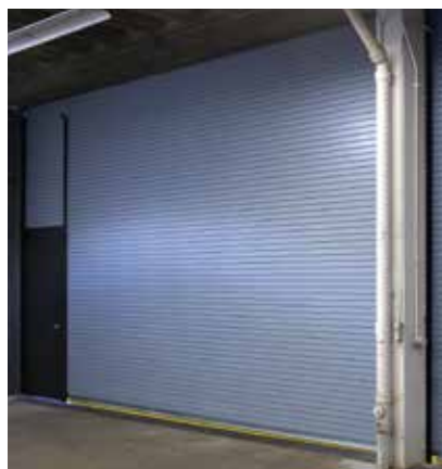
No. 14 slat, shown with a Pass Door